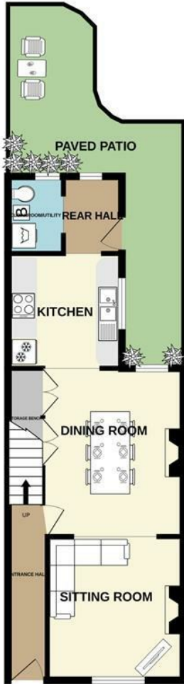
GROUND FLOOR 456 sq.ft. (42.4 sq.m.) approx.