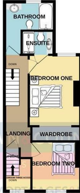
1ST FLOOR 406 sq.ft. (37.7 sq.m.) approx.